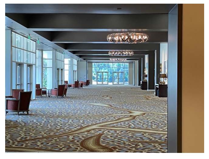
Exhibit Hall Location