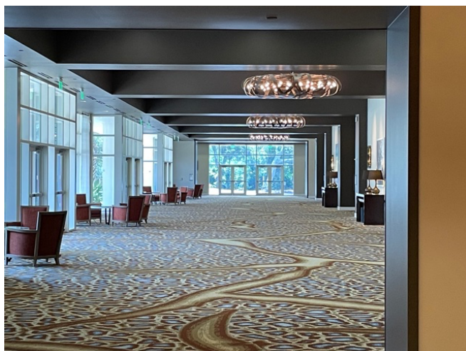
Exhibit Hall Location